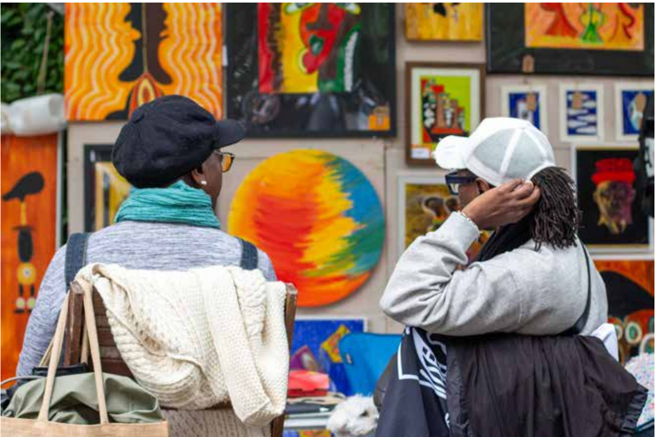
Urban Art 2025