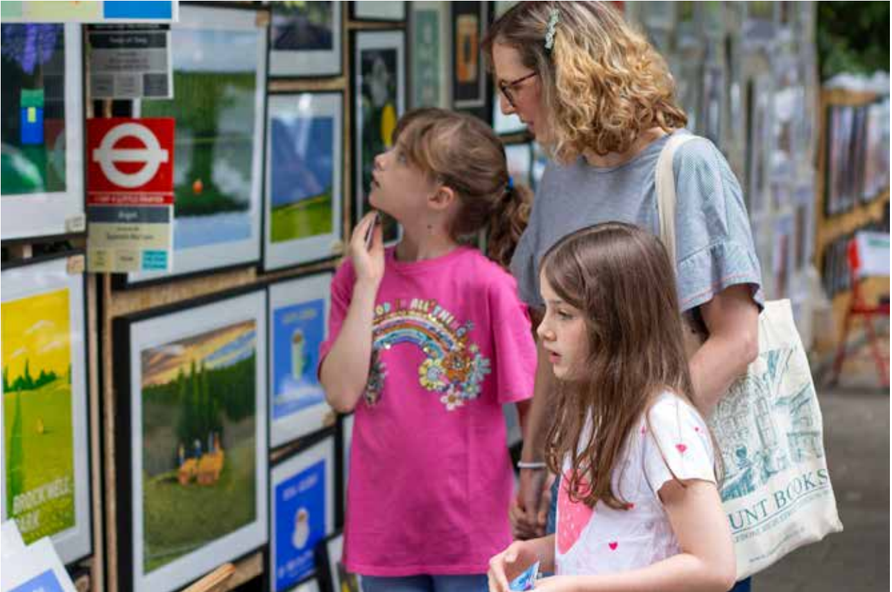
Urban Art 2025