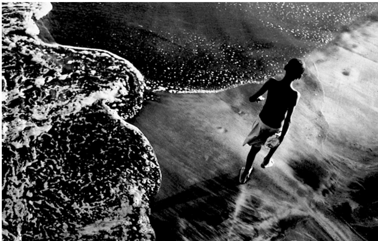
Exhibitor -Chris Prentice