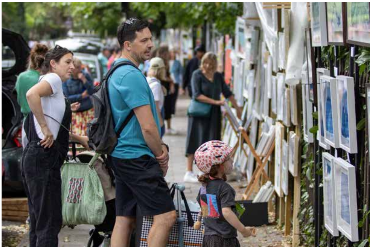
Urban Art 2024