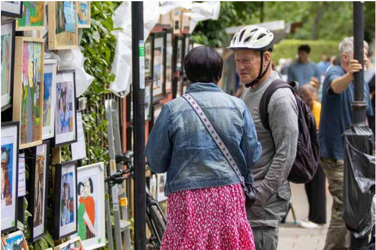
Urban Art 2025