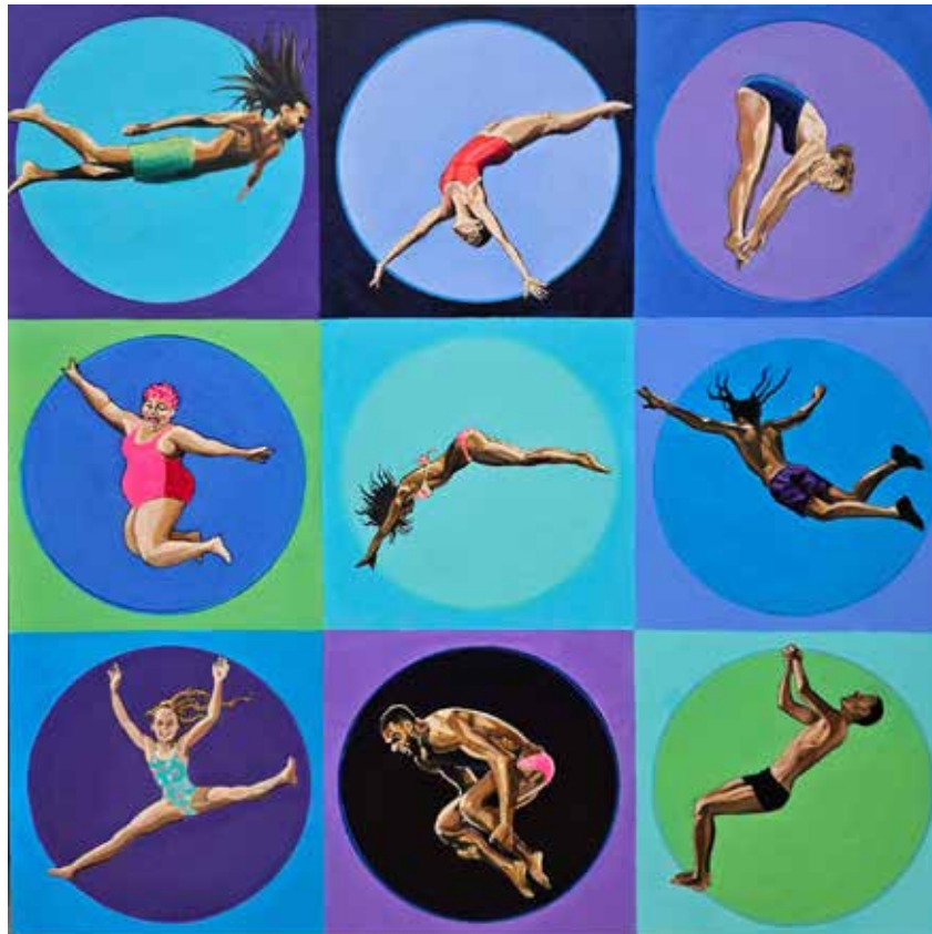
Exhibitor - Aabella Yapp