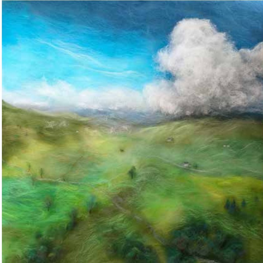
Exhibitor - Lucy Storrs