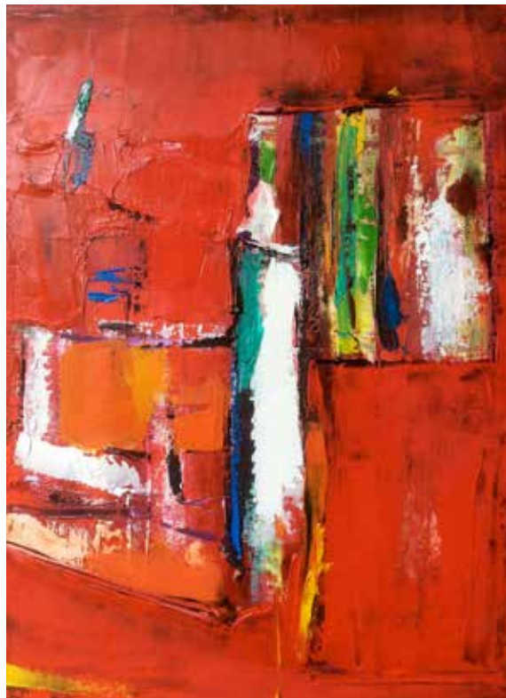
Exhibitor - Corinna White